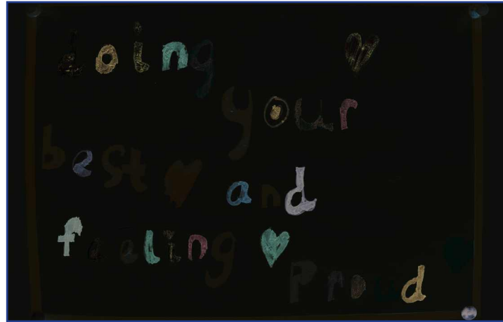
Child's art showing one of the elements of well-being.

Weaving Well-Being is an SPHE programme designed to teach children skills and strategies which develop positive mental health, and so promote well-being, in accordance with this definition. The skills are based on current research from the field of Positive Psychology.